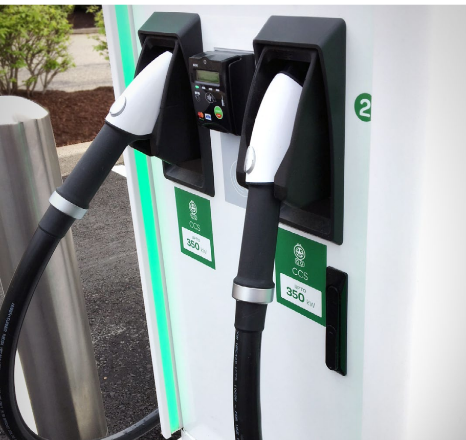
ABB charging stations on Electrify America's network accommodate both CHAdeMO and CCS-1 compliant vehicles in multiple power levels.

What's key within this continued evolution is the brilliance that standards can offer: backwards and forwards compatibility, ensuring that the vehicles