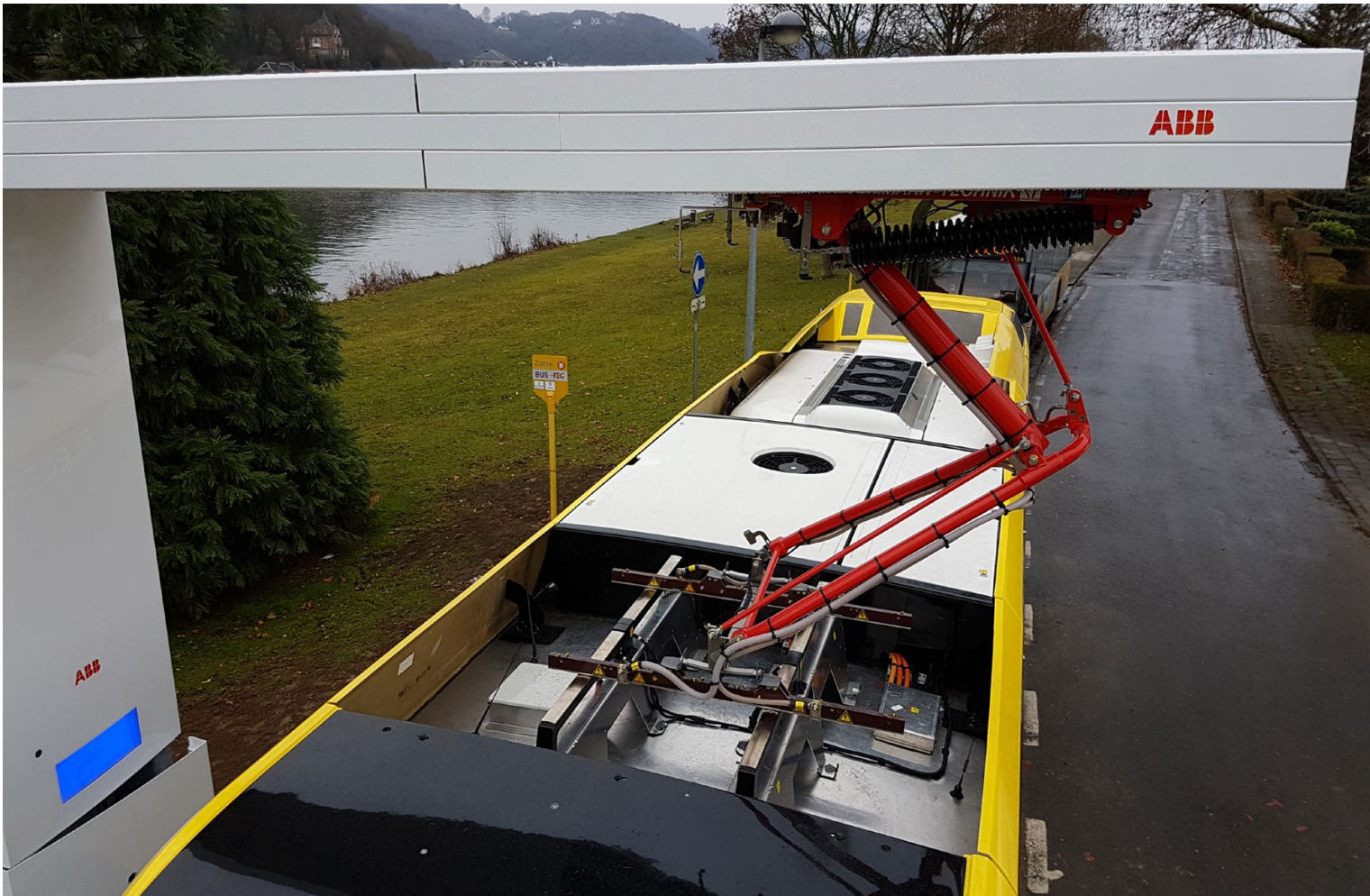
— A close-up view of an overhead pantograph to eBus connection using the OppCharge standard