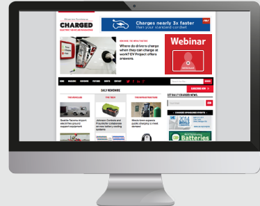
Digital Banner Ads