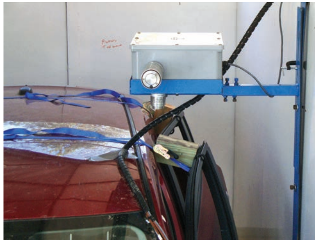
Figure 2: Gas emissions measurements

TÜV SÜD engineers prepared each test vehicle with temperature measuring and voltage measuring hardware. The thermocouples were located in several locations in the vehicles to detect any rising temperatures in the battery pack or selected 12 volt components. Voltage sensing lines were connected to the contactors on both sides of the contacts and on the 12 volt signal lines that controlled the contactors.