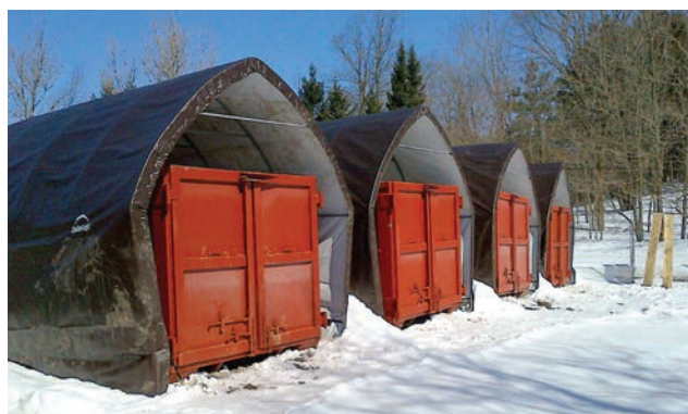
Figure 3: Immersion test vessels